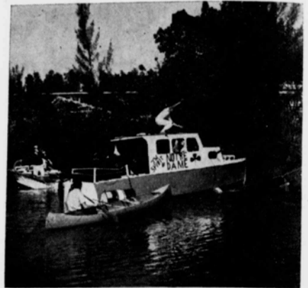
CRANE LOWERS BOAT INTO THE STUDENT LAKE Now To Get It Into The Center Of The Lake . . .