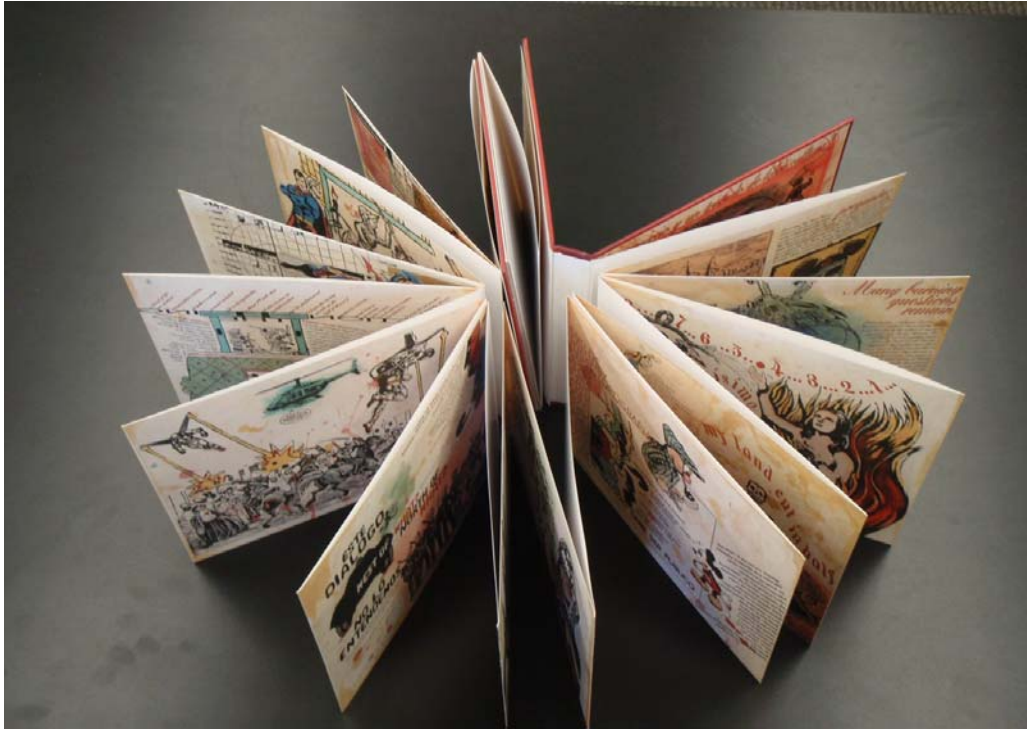
Fig 1 Codex Espangliensis Reproduced from the edition held in Special Collections at the University of Miami