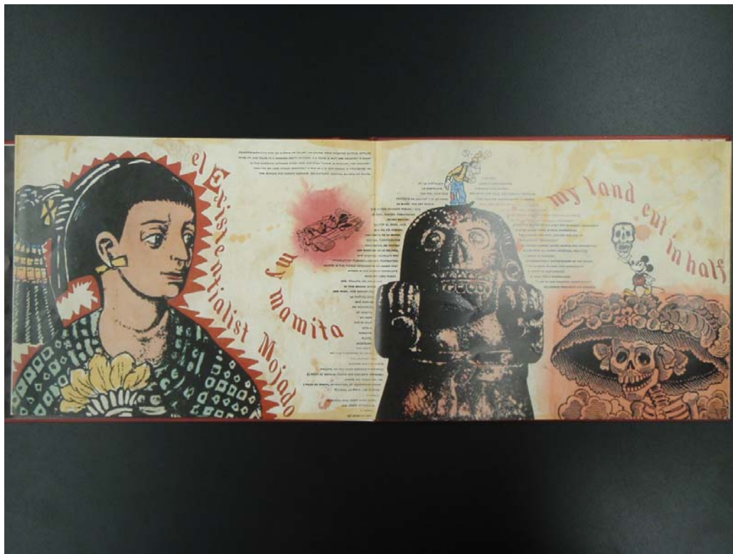
Fig 2 First screen of "El Existentialist Mojado" Reproduced from the edition held in Special Collections at the University of Miami