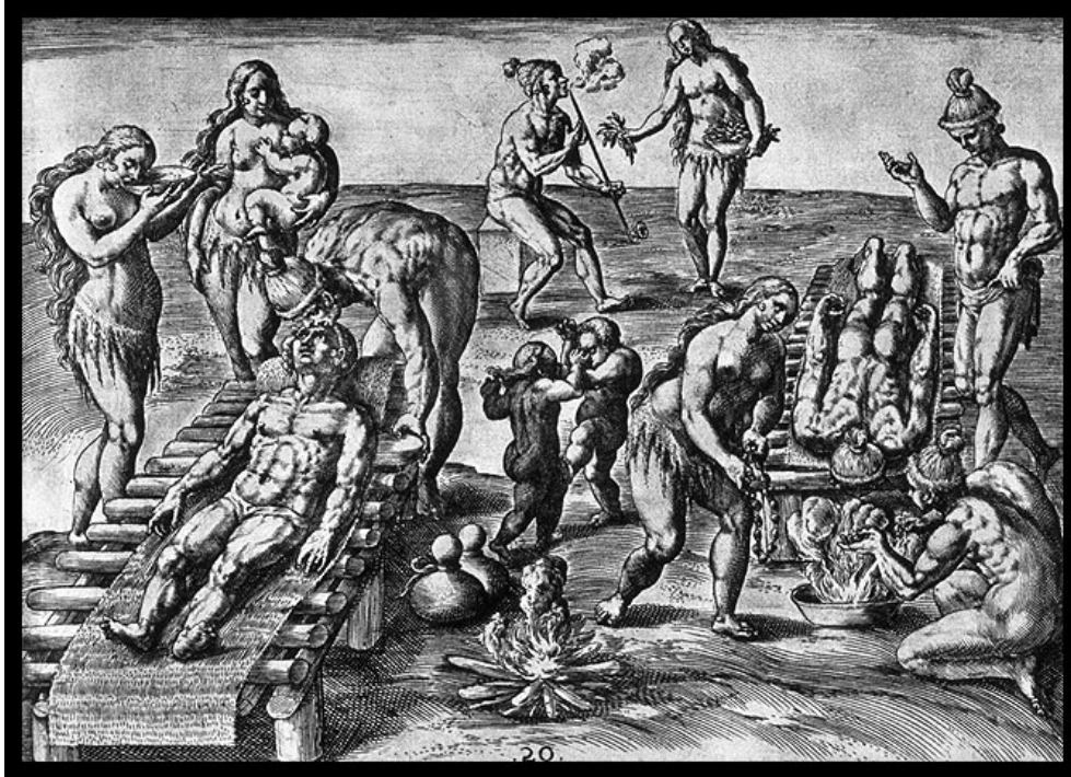
Fig 5 An image from Theodore De Bry's America Reproduced from the edition of America held in Special Collections at the University of Miami