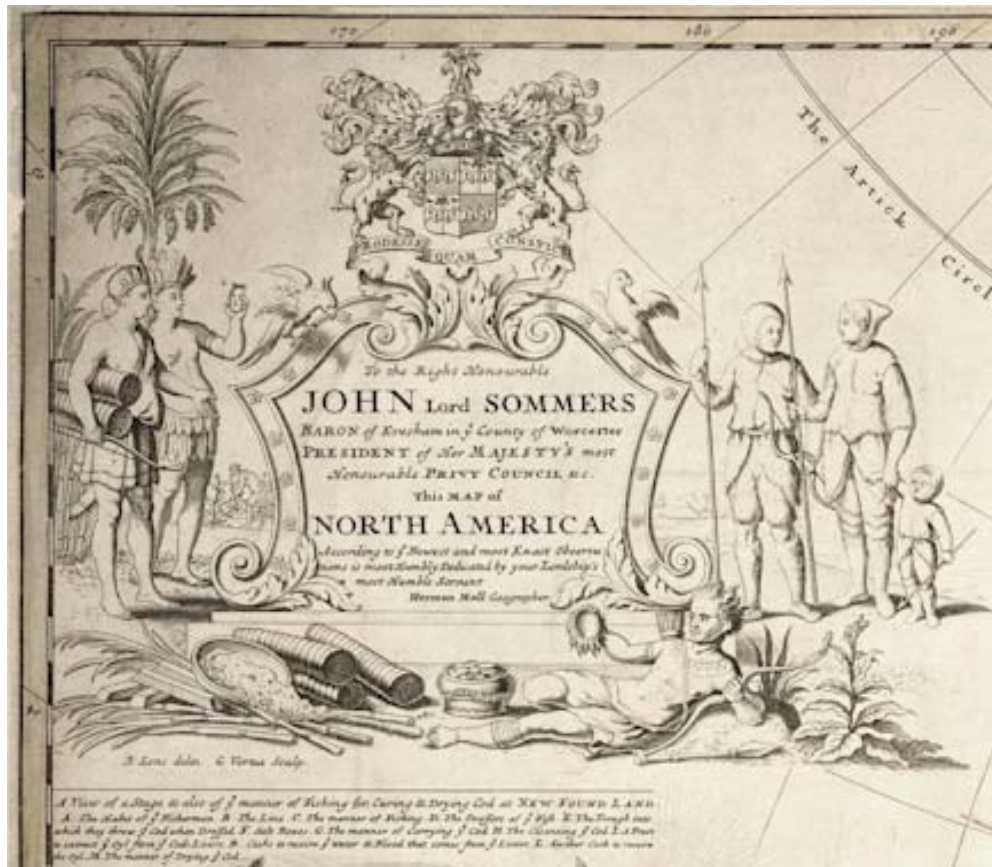
Fig 7 Detail of the cartouche from Herman Moll's Codfish Map (1718)