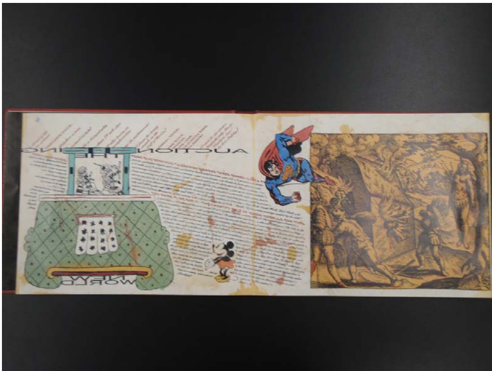
Fig 4 "Auctioning the New World"