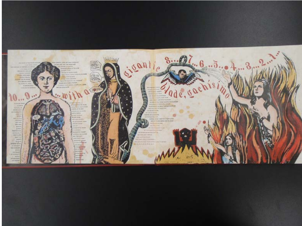
Fig 3 Second screen of "El Existentialist Mojado"